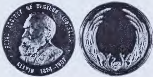
Figure 6. The Kelvin Medal of the Royal Society of Western Australia.